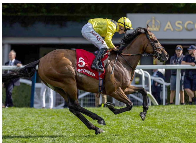
Elnajmm winning the 2024 Betfred Handicap