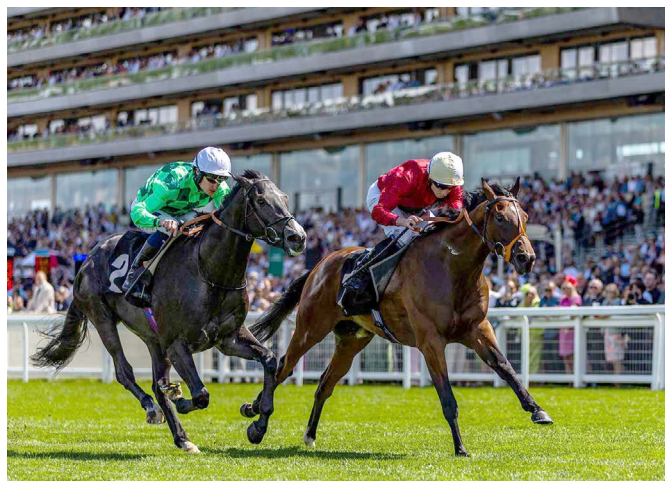
Simmering winning the 2024 Sodexo Live! Princess Margaret Stakes