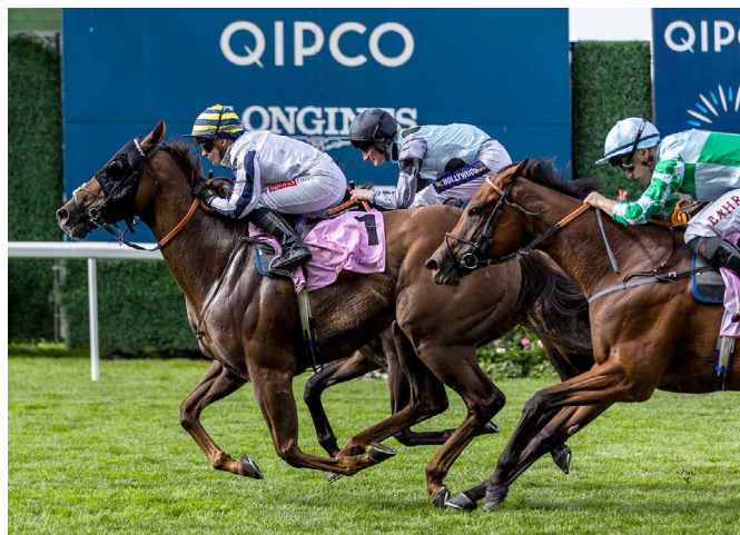
Albasheer winning the 2024 Whispering Angel Handicap